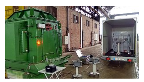
Fig. 6: On-site test on a 4500 MVA pump motor with the resonant test system

Mostly, off-line tests are carried out during maintenance outages or online by using permanently or provisionally installed cou-