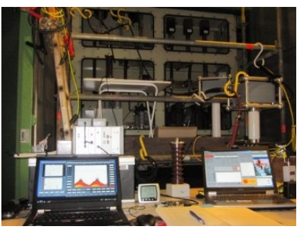
Fig. 7: On-site PD and TD test on a 150 MVA turbo generator

pling units during regularly surveys. With the communication techniques of today, even remote monitoring can be offered as a service.