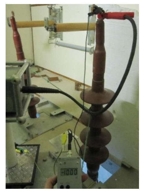
Fig. 11: PD calibration prior to an offline PD test

Partial discharges may appear in power cables and accessories as a result of insulation defects. Very often the problem is not present in the solid insulation material, e. g. in the extruded polyethylene (XLPE), but can be more frequently related to dielectric problems within the accessories such as end terminations and joints. Occasionally, internal cavities are detected in new cables caused imperfect by production processes.