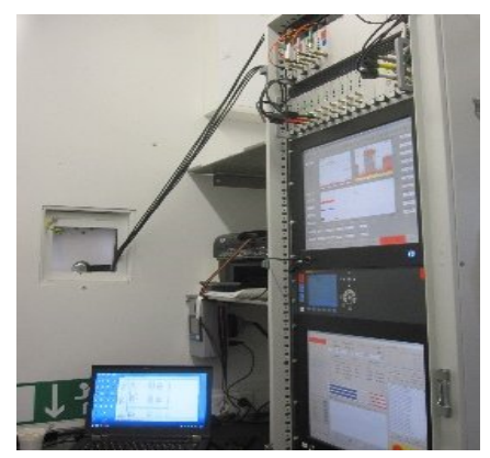
Fig. 2: Control room of the truck

For off-line testing, we are equipped with two mobile test systems and portable equipment. With the large test set, a 2 MVA converter based system, embedded into a 40 feat standard container, we can offer both induced (up to 90 kV) and applied voltage testing (up to 500 kV). The test system is selfcontained for on-site tests reguiring up to 100 kVA by using a generator mounted to the auxiliary tap axle. When operating the system in resonance mode we only need to inject the losses, and, hence, a couple of kW' is sufficient to cover a 500 kV applied voltage test, for instance. When more input power is needed, the test system can be supplied by diesel generator.