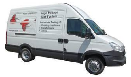
Fig. 3: Medium voltage test van

The medium voltage test system comes with a 100 kV/11 kVA AC dielectric for testing dry type transformers, medium voltage switchgear or short cable jumpers, for instance. In case of larger capacitive loads, the van can be extended with a trailer, providing a 500 kVA/50 kV resonant test system. Similar to the large test set, this system is also self-contained for power requirements up to 16 kVA.