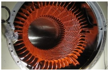
Fig. 5: Stator winding of a turbo generator

Although the current epoxy mica insulation system widely tolerates partial discharge activity, insulation condition monitoring becomes more and more a standard in this branch and is strongly recommended in order detect possible dielectric to problems in an early stage. Both motors and generators can be tested off-line with our medium voltage test set. The 50 kV/500 kVA allows energizing of small motors up to large windings of hydro generators.