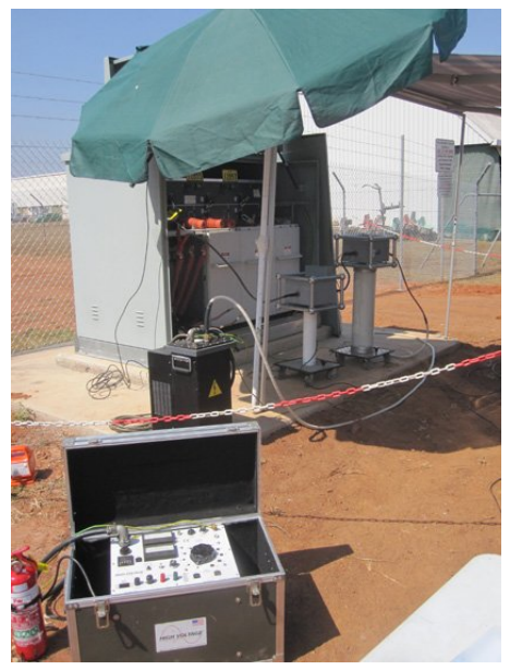
Fig. 15: On-site PD and TD test on medium voltage cables using VLF (0.1 Hz)

Besides using our power frequency sources, we can assess medium voltage cables using very low frequency (VLF) hi-pots up to 60 \text{ kV}_{peak} .