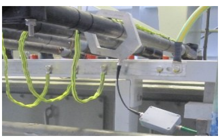
Fig. 12: Near field PD test with HFCT and portable PD detector

criteria are given. The partial discharge test procedures have been recently updated and extended in the new edition of the IEC 60885-3 that was released last April. Currently, we experience an increasing demand for on-site PD testing as part of the after installation test (SAT) and we expect that this demand will show an increasing tendency since several Cigré (CIGRE WG D1.33 and IEEE (400.3) working groups are proceeding on reguired procedures for on-site testing of medium and high voltage class cables. Re-testing the cable's main insulation with a certain sensitivity, but, mainly verifying the performance of the accessories fitted are very important and can offer installation companies a certain guarantee on their work. It stands to reason that re-testing the cable according to standards is not feasible with typical on-site sensitivities from a few tens up to 100 pC. Comparing the shielded environment with the often noisy substation backgrounds, sometimes require to measure into frequencies exceeding the IEC 60270's limits, which can influence the signal properties of the high frequency partial discharge pulses along the cables length. However, in such cases the global measurement circuit using a regular coupling capacitors can then be extended by using portable PD detectors and near field sensors such as