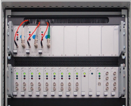
FOsystem and ICMsys8