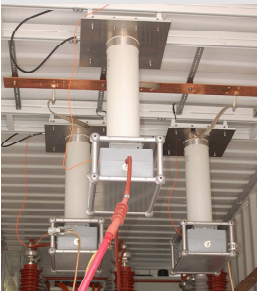
HV filters TVC100/123