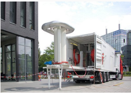
Test system with moved out reactor