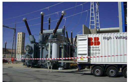
On-site transformer testing

It is designed for performing routine and special tests according to standards as IEC 60060-3, IEC 60076, and IEEE Std. C57.12.00 and, thus, giving accurate and