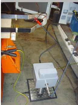
TD measurement on motor bars