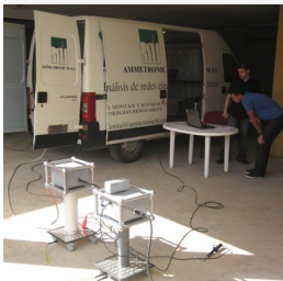
ICMflex & HV filter